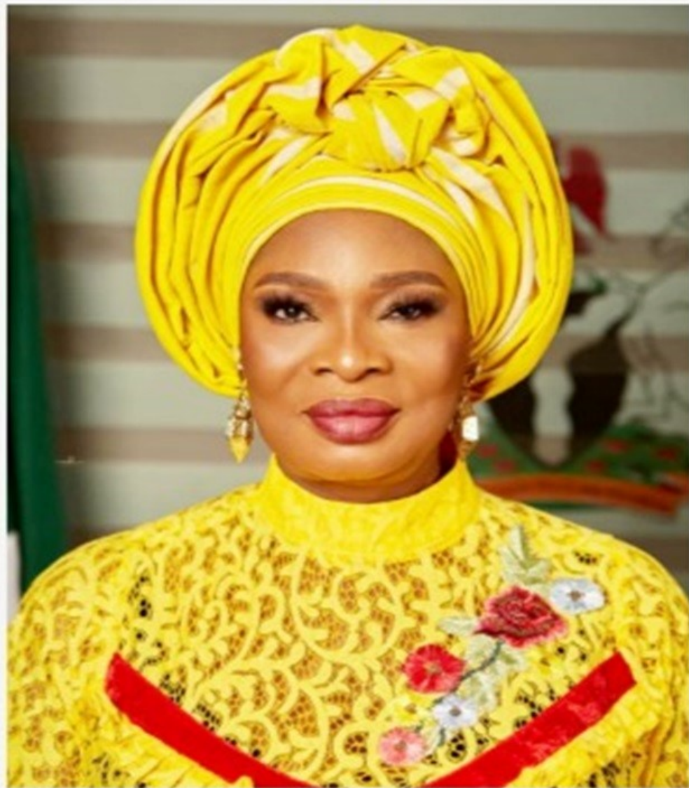
PRINCESS PATRICIA OBILA DEPUTY GOVERNOR OF EBONYI STATE